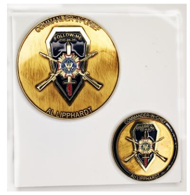
Commander-in-Chief Medallion and Coin

Below you will see examples of some of the awards and items mentioned in this program. For more information, contact the VFW Membership Department.