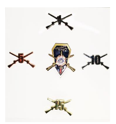
Commander-in-Chief Pin and Recruiting Pins